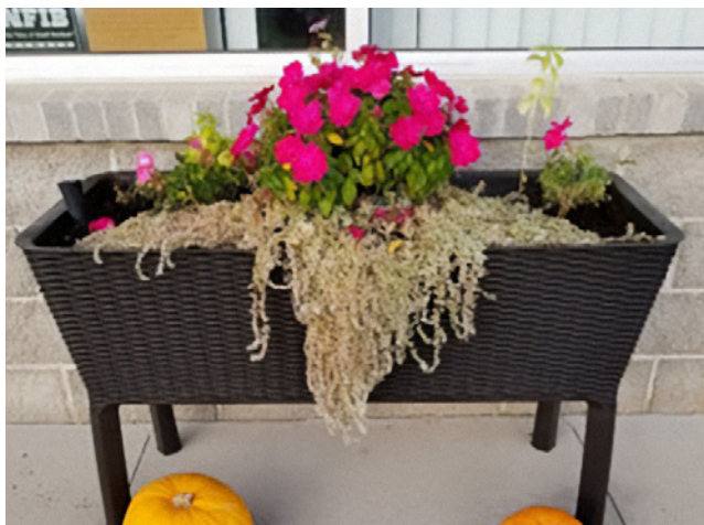
Two local senior facilities in Unit 21 received raised bed planters for the residents to enjoy.

The planters, which are self-contained, allow residents to continue to enjoy the joys of planting and tending a garden at a height best suited for them. Additionally, the planters can be moved indoors for the continued enjoyment of the residents and staff alike.