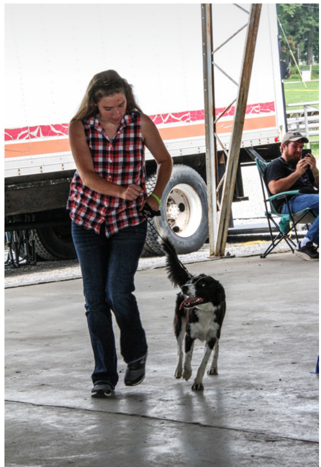
4-Hers show off their “best friends” at Clay County Dog Obedience Show