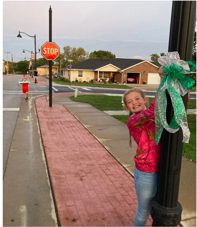
4-Hers hang ribbons in communities in Effingham County during National 4-H Week.

After having a short conversation about static electricity, it was time to buzz around the room to transfer their pollen from flower to flower. As the worker bees came to a stop, the class discussed the importance of pollination for the types of flowers that we enjoy every day.