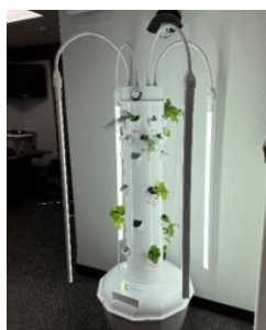
This Tower Garden is a great learning tool for grades K-8