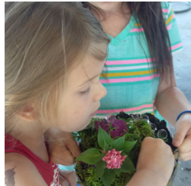
Cloverbuds enjoyed a day of fun-filled activities during Camp Cloverbud

4-H Cloverbud members enjoyed a fun-filled day at the Jasper County Fairgrounds, participating in many luau and beach-themed activities. The Jasper County 4-H Ambassador team organized and facilitated all of the activities during the event. Cloverbud members started with icebreakers that introduced both their fellow Cloverbuds and the 4-H Ambassadors. Throughout the day, Cloverbud members made ocean themed Jell-O cups and jellyfish crafts. Since this age group is very active, Ambassadors ended the hot day with some fun water games. Both the 4-H Cloverbuds and the 4-H Ambassadors learned from each other and had a great day.