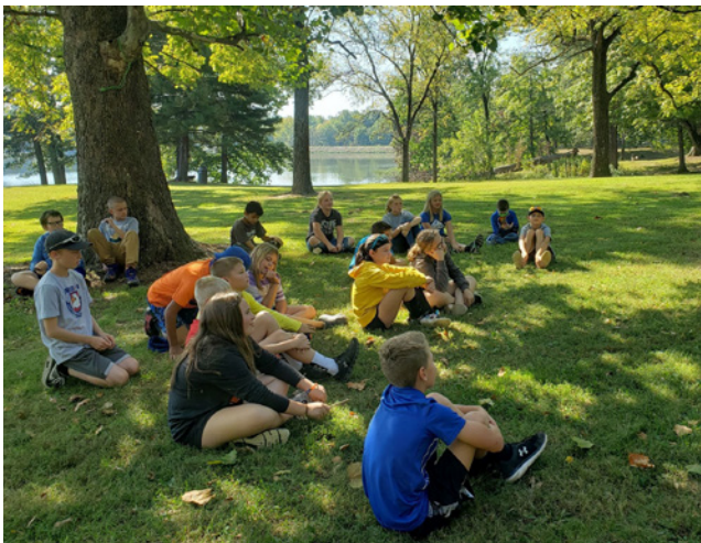
Sixth Graders attend Jasper County Conservation Field Day at Sam Parr Park

To complete the conservation education, each student completed a project focusing on one conservation area. The Jasper County Extension and the Jasper County SWCD have been able to bring this program to the sixth grade students in Jasper County for over 30 years with the cooperation of the Jasper Community Unit 1.