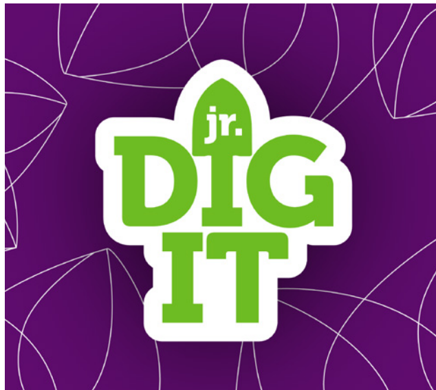
The Dig It! And Dig It! Jr magazine is a 4 page age-appropriate magazine created to teach children about gardening through fun activities.

Dig It Jr! is geared for students kindergarten through fifth grades, and the Dig It! is geared for students in sixth through eighth grades. The first issue, Spring, will be released on March 1, 2022. The Fall magazine will be released on September 1, 2022, followed by Summer and Winter in 2023.