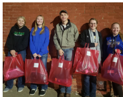
Toys for Kids Program makes Christmas a little brighter for over 200 Jasper County youth

Since 4-H clubs and other local youth organizations budget and shop to make the most of the money allotted for each child, the program also teaches money management and community service. The Toys for Kids program provides a positive experience for everyone involved, whether they are a volunteer assisting with the shopping and organizing, or a youth receiving gifts for a brighter holiday.